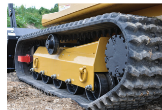
20" (500mm) wide rubber track