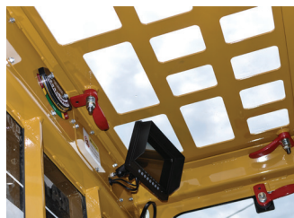
Rooftop escape hatch and full color, dedicated backup camera display