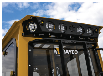
Protected LED Lights (9700 total lumens)